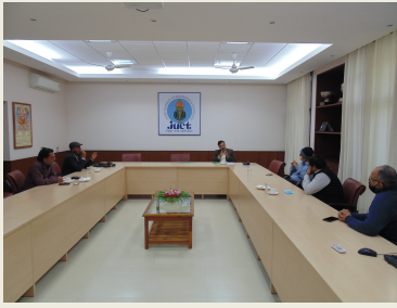
Campus visit by officials from NPTI, Shivpuri.