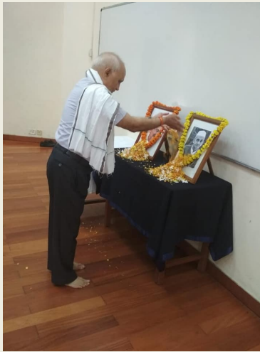
Floral tribute to Gandhi ji & Shastri ji on October 02, 2020 at JUET, Guna.