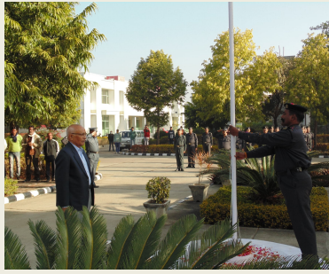
Republic Day 2021 Celebration