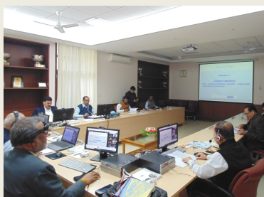
17th Meeting of Board of Management on December 16, 2020.