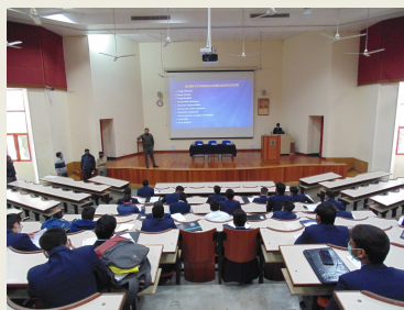
Alumni Meet 2021 on January 29, 2021.