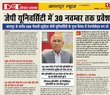
Media coverage@JUET, GUNA